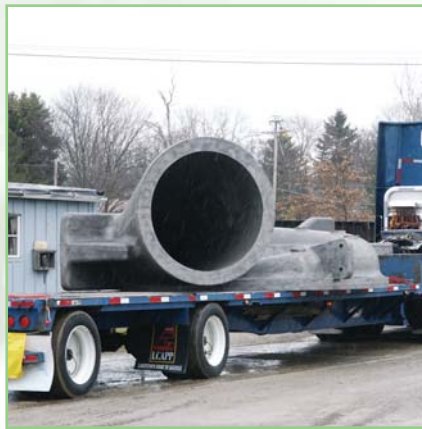
Oil and Gas Volute (60,000 lbs.)