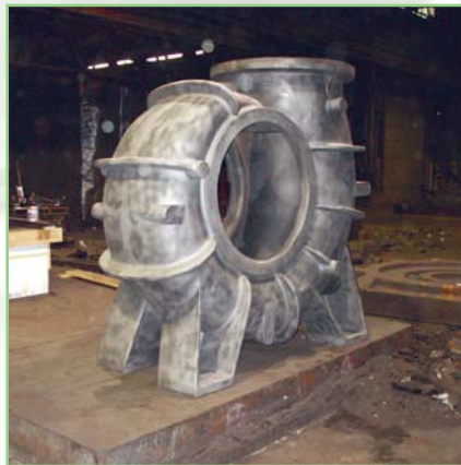
Pump (11,000 lbs.)