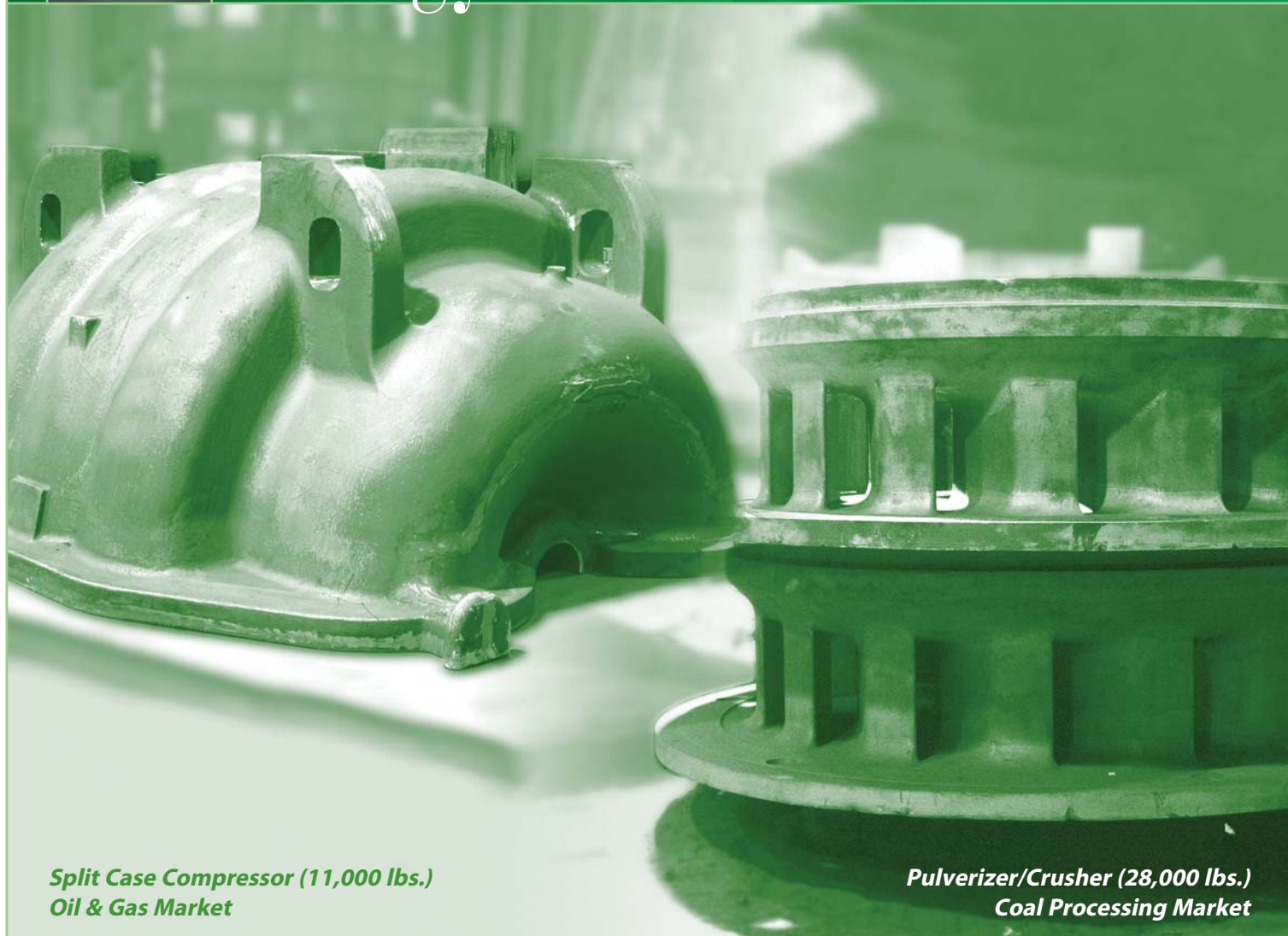
Split Case Compressor (11,000 lbs.) Oil & Gas Market