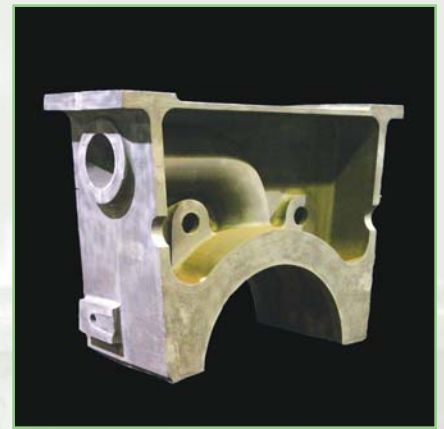
Bearing Pedestal (6,000 lbs.)